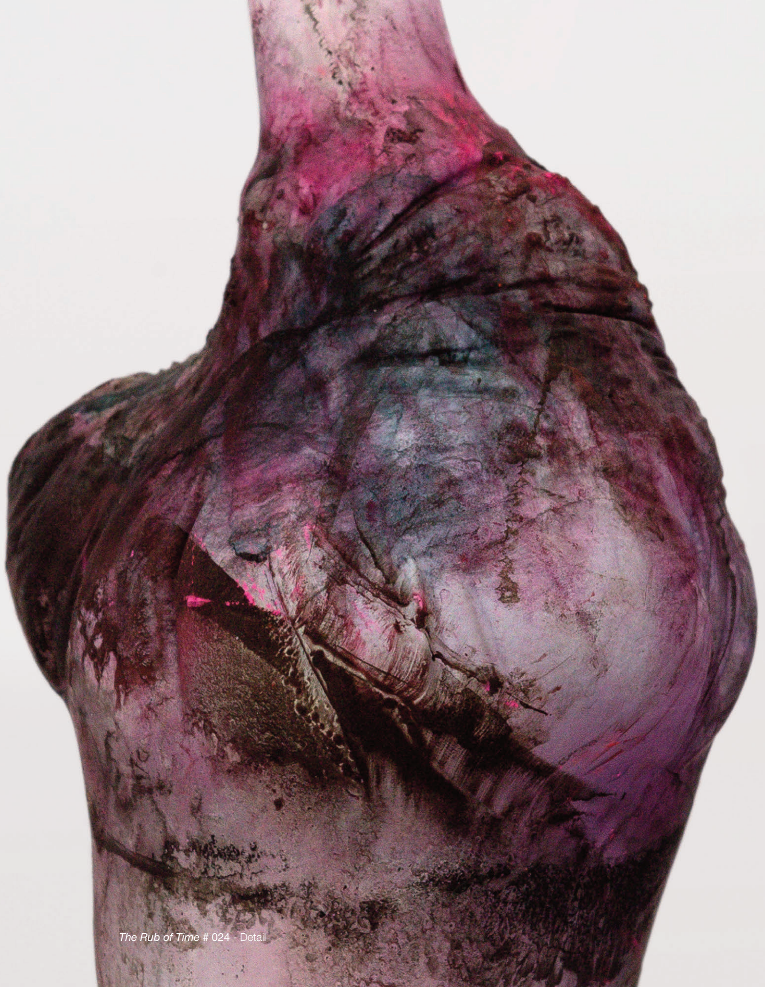
The Rub of Time # 024 - Detail