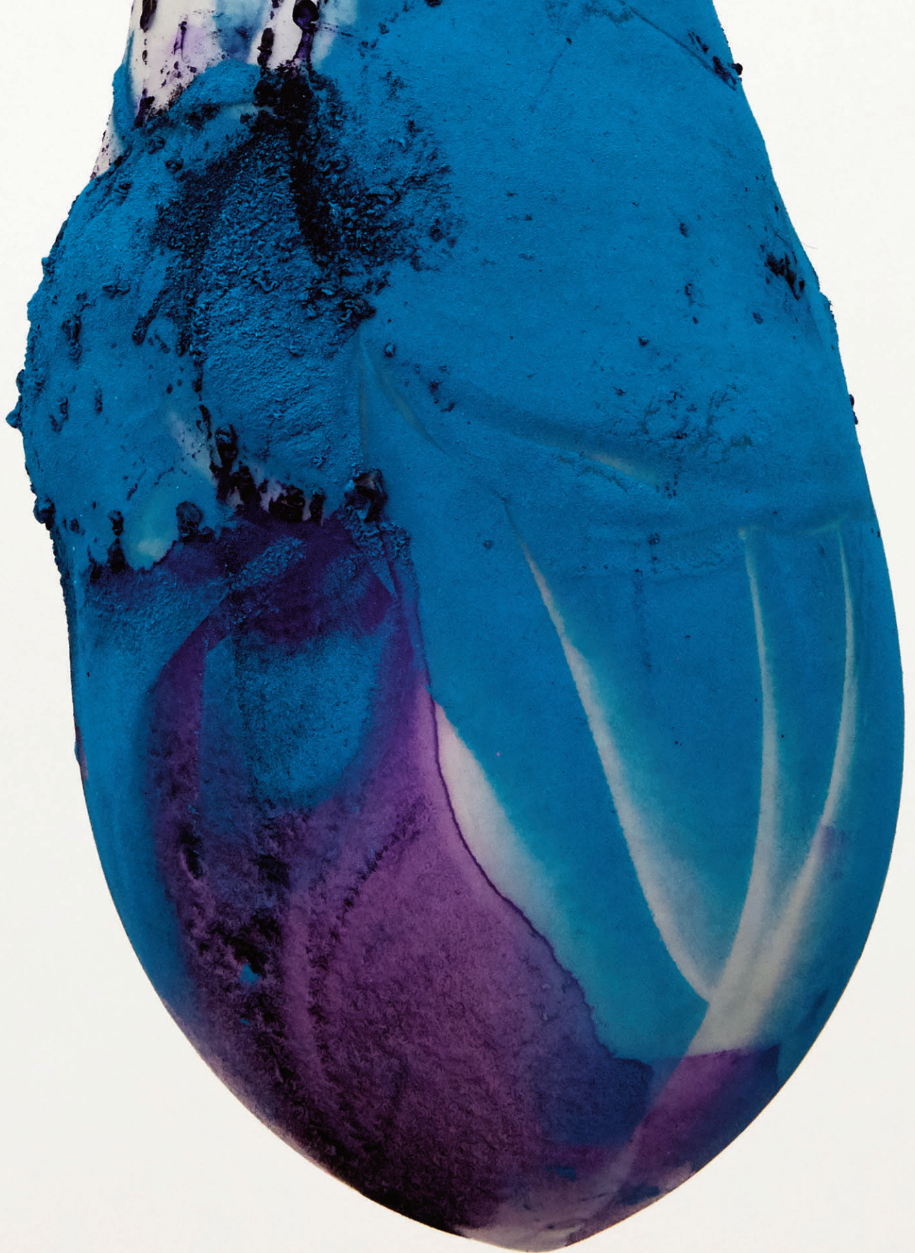
The Rub of Time # 007 - Detail