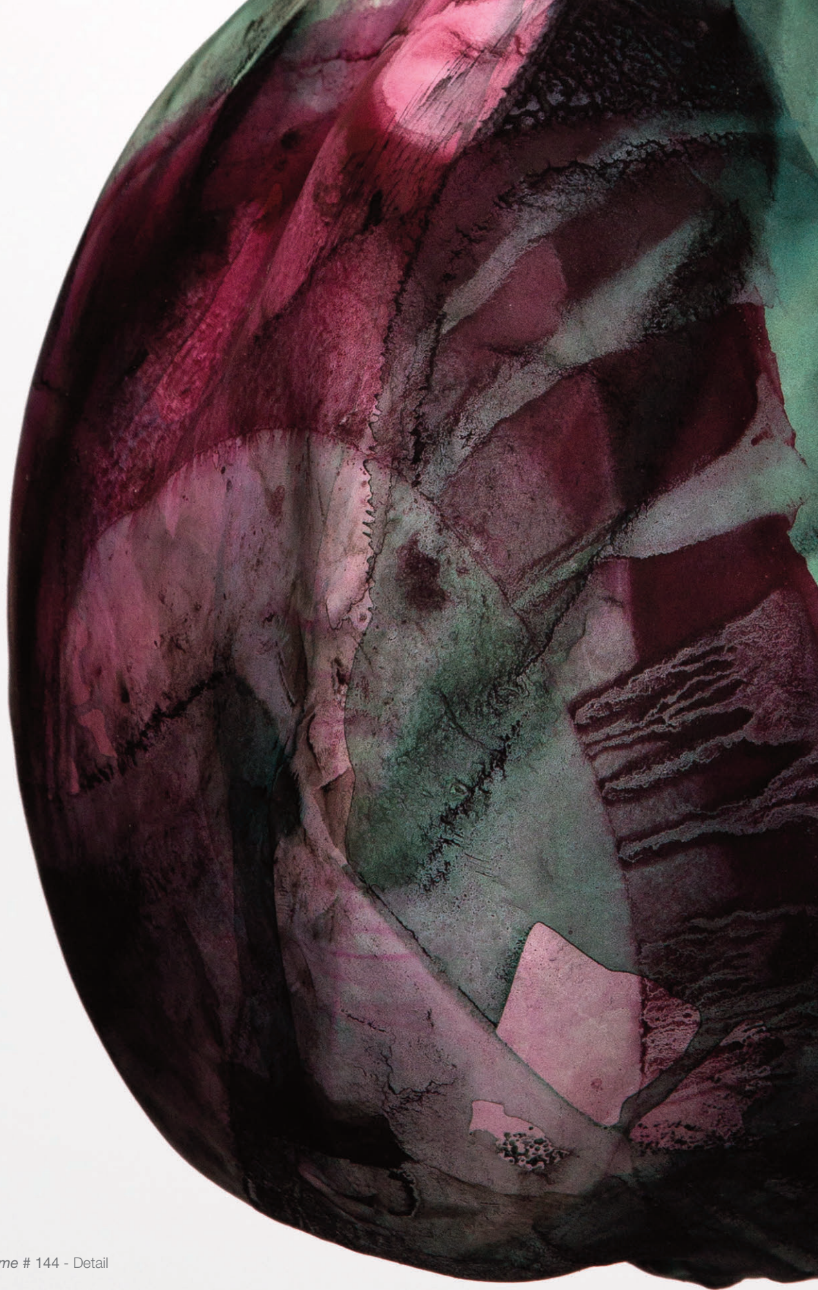
The Rub of Time # 144 - Detail