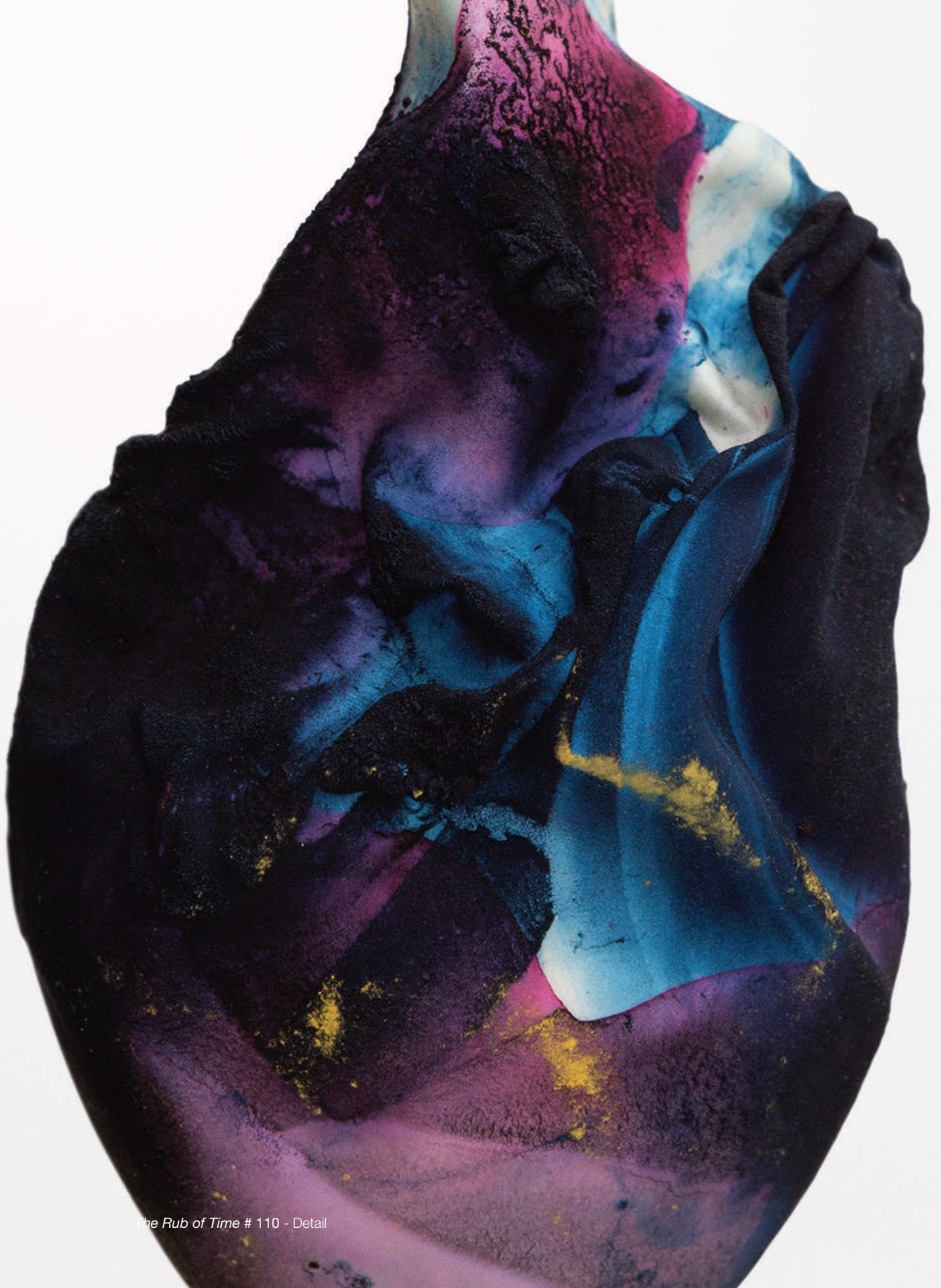
The Rub of Time # 110 - Detail