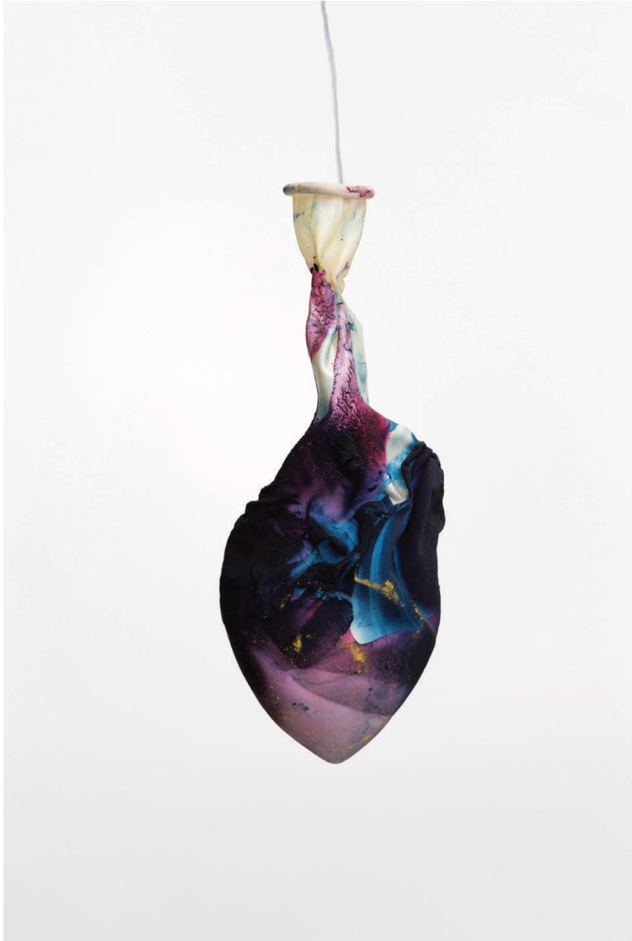
The Rub of Time # 110 - Giclée Print on Hahnemühle paper - 2016