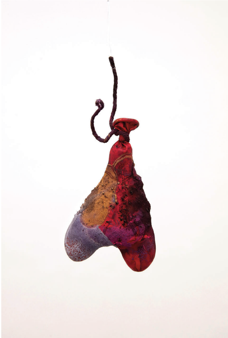
The Rub of Time # 144 - Giclée Print on Hahnemühle paper - 2015