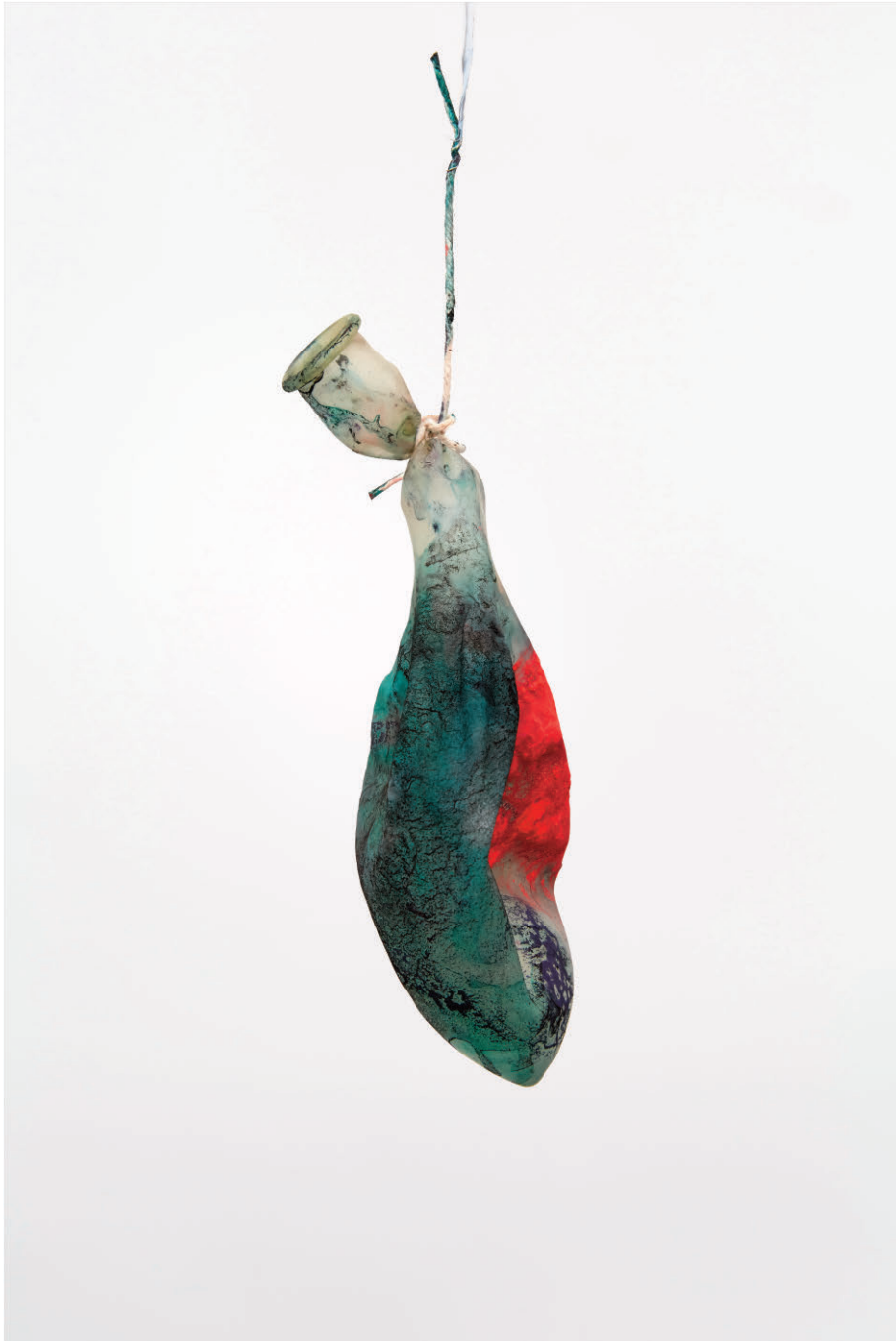
The Rub of Time # 022 - Giclée Print on Hahnemuhle paper - 2016