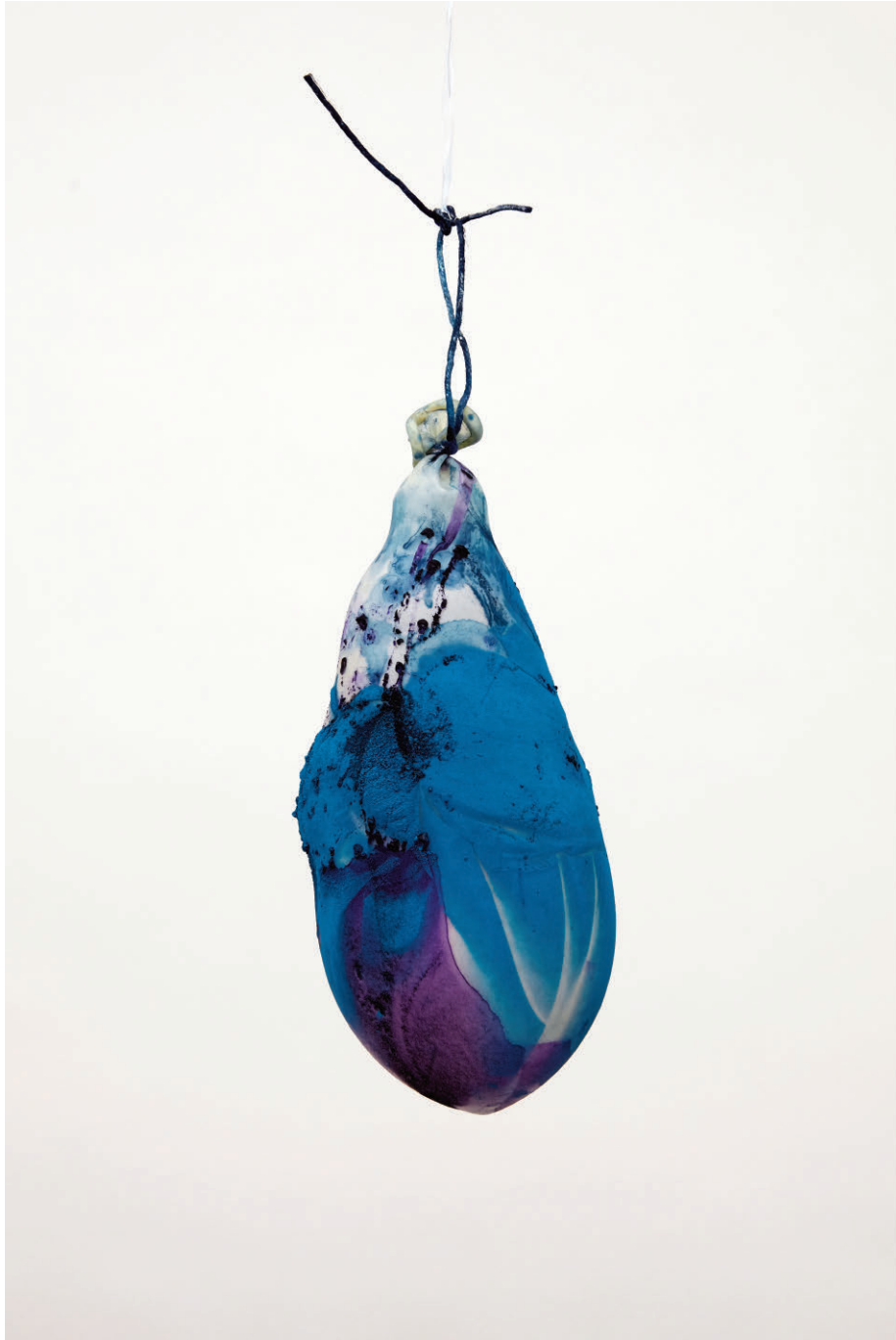
The Rub of Time # 007 - Giclée Print on Hahnemühle paper - 2016