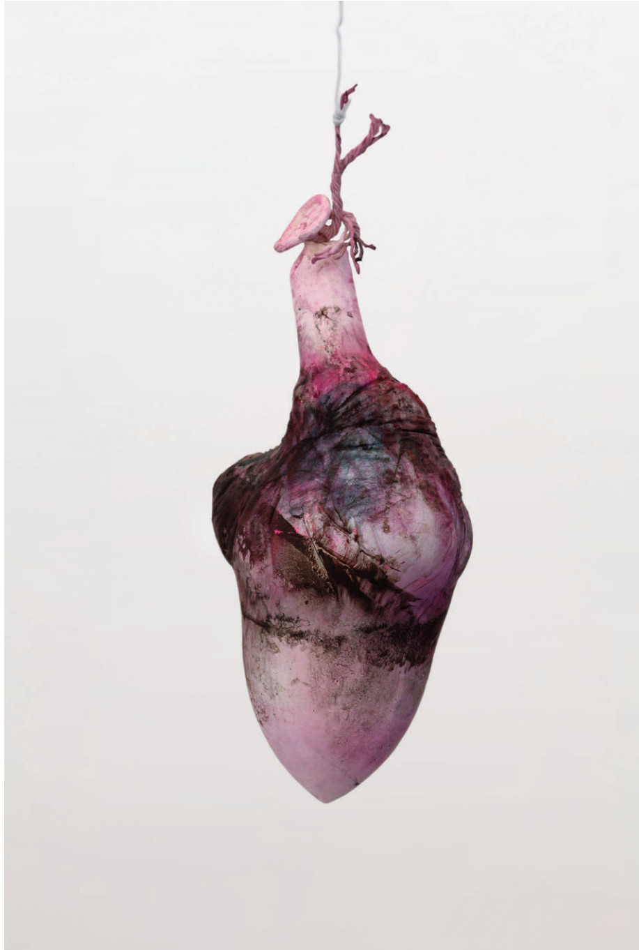
The Rub of Time # 024 - Giclée Print on Hahnemuhle paper - 2015