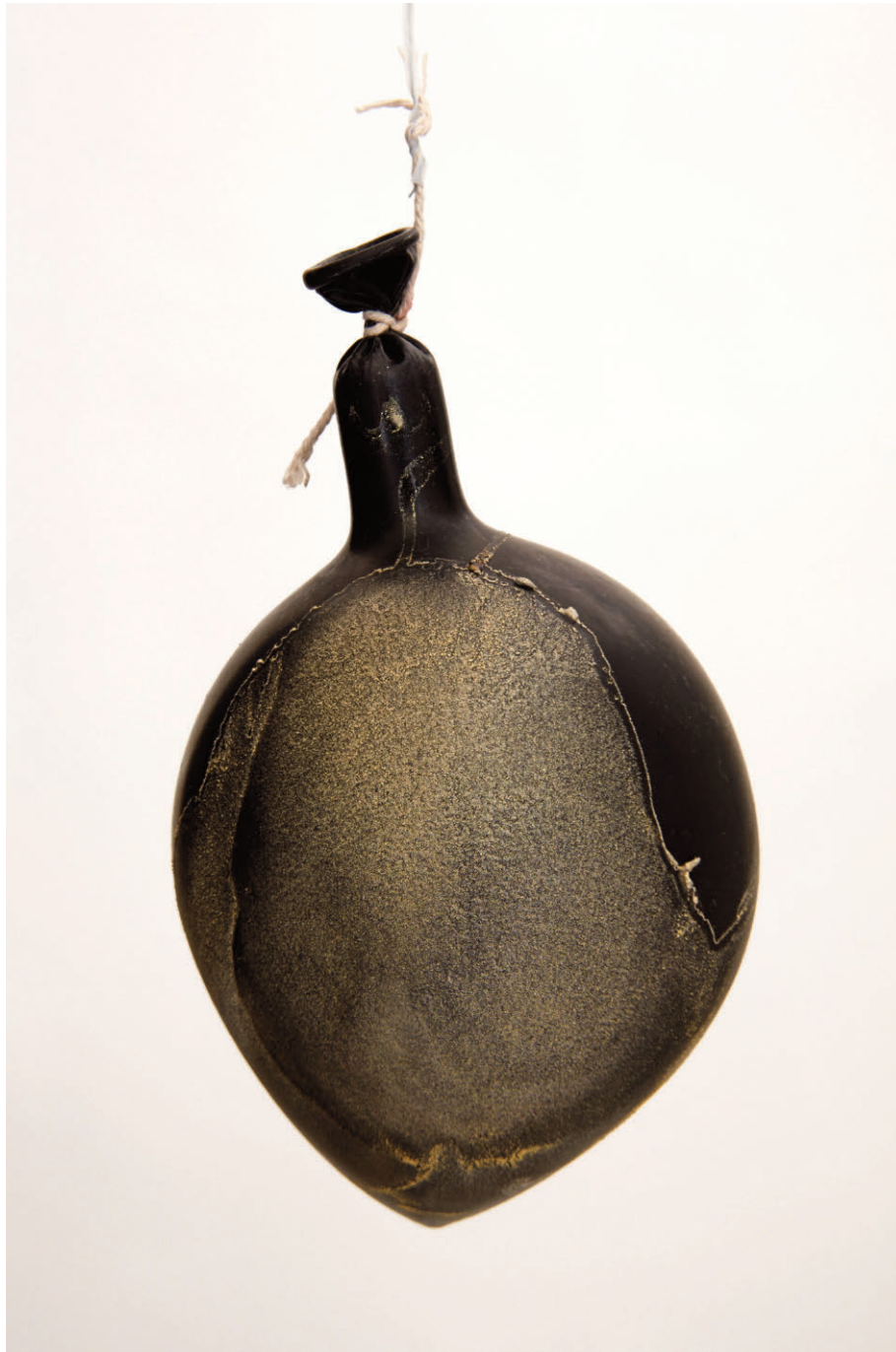
The Rub of Time # 140 - Giclée Print on Hahnemühle paper - 2016