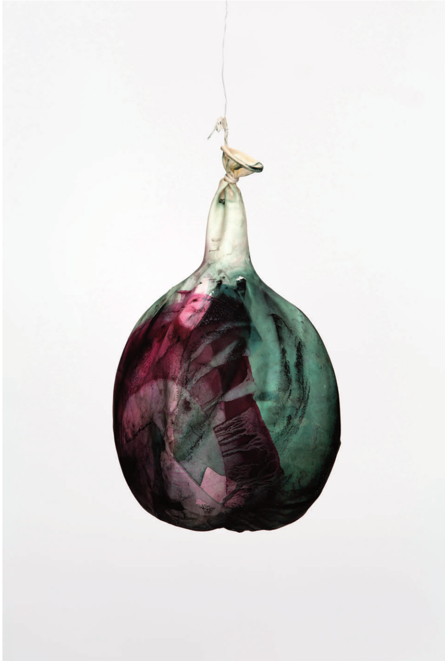
The Rub of Time # 144 - Giclée Print on Hahnemühle paper - 2015