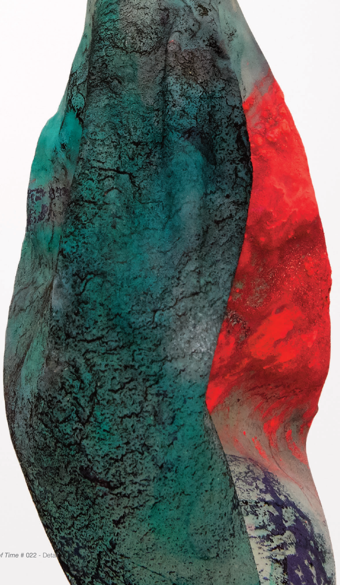
The Rub of Time # 022 - Detail